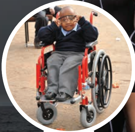
Photo: KAPAD KROPP (E. Ohlsson Wallin and L. Axelsson) © Scandinavian Orthopaedic Lab.